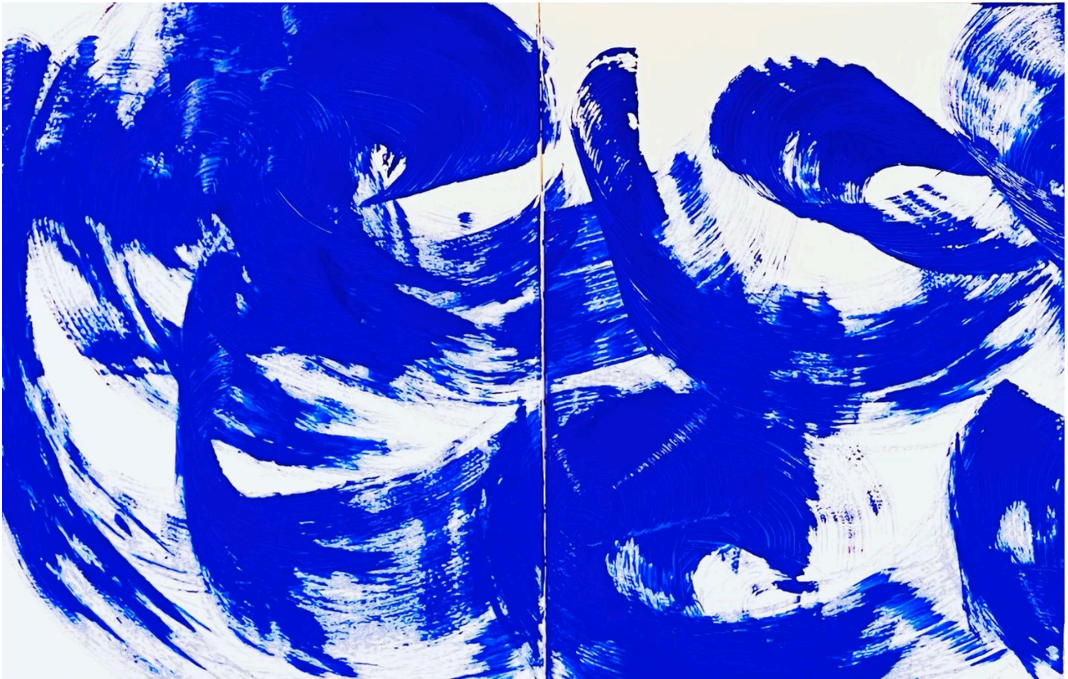
Une femme à la peau bleu