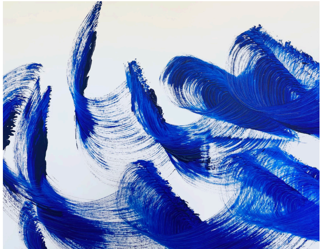
Une femme à la peau bleu

“Through this intense and deep blue that I use on my canvasses, it's all the waves of our Mediterranean Sea that are revealed but also the sensuality, femininity, temperament and personality of the women from the South that I intend to unveil in NY at the Maison de la Région Occitanie with the collection “A woman with a blue skin” GA